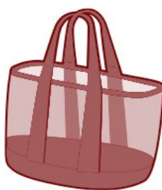
OVERSIZED TOTE BAG